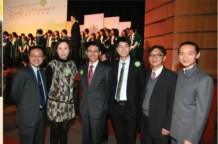
8. Teachers and guests at The Centennial Gala Dinner of HKU in Dec 2011