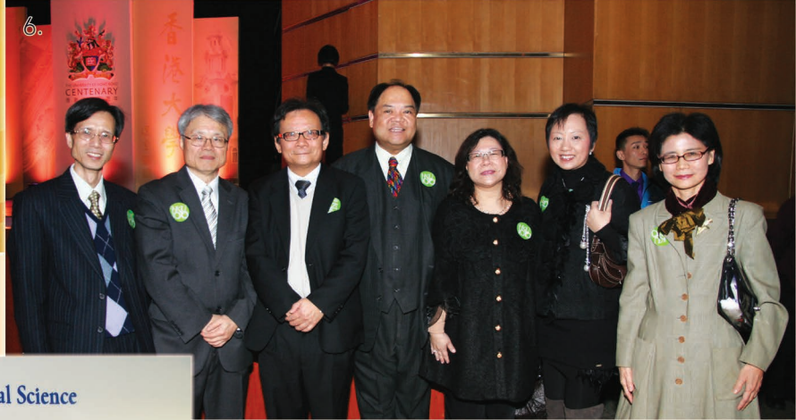
6. Teachers and guests at The Centennial Gala Dinner of HKU in Dec 2011