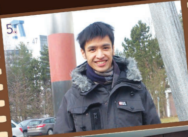
1. Statistics class "Statcity" Year 1 class photo taken in 1998