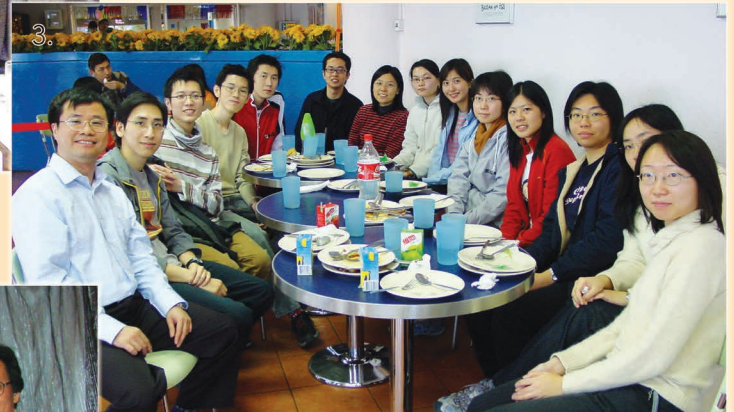
3. Christmas Party with RPGs, teachers and staff in Dec 2003