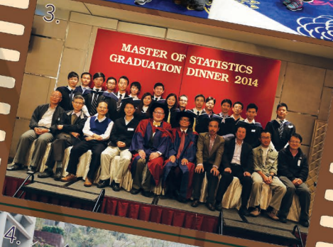
3. Master of Statistics Graduation Dinner 2014