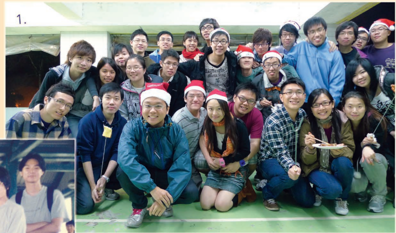
1. Christmas Party of Exco of SASS from 03-10 taken in 2009