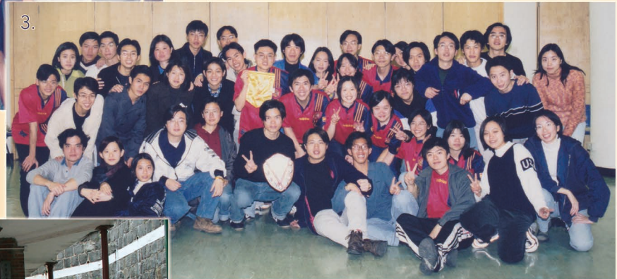
3. Students won the Statistics Shield Champion of 97-98