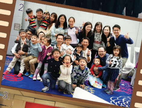
2. See! Maybe we are the biggest Chong! 97-98, the warmest!