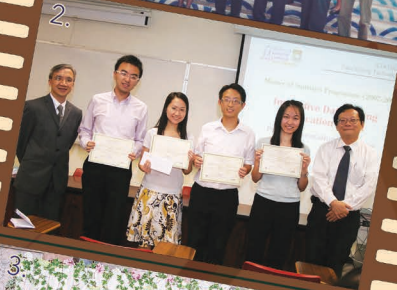
2. Award Recipients at MStat Innovative Data Mining Application Award Presentation Ceremony 2008