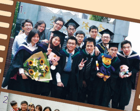
1. Graduation Photo of SASS Exco 03-04