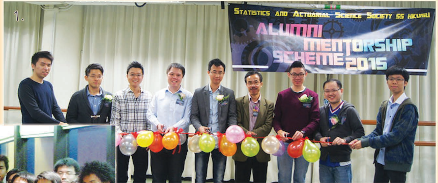
1. Alumni Mentorship Scheme 2015