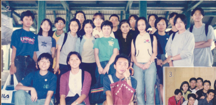
2. Freshmen majoring in Statistics attended O-camp in 1997