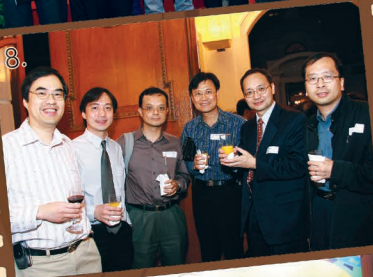
8,9. Cocktail at 40th Anniversary Banquet