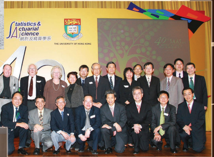
6. Hosts and guests at 40th Anniversary Banquet in 2008