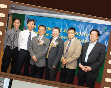
1. Speakers and guests at an Academic Seminar on World Statistics Day in 2010