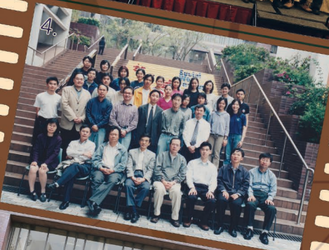
4. Statistics class "Statcity" Year 3 class photo taken in 1998