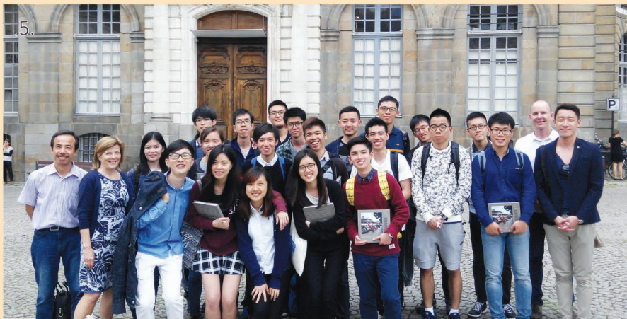
5. ENSAI summer camp in France in 2016