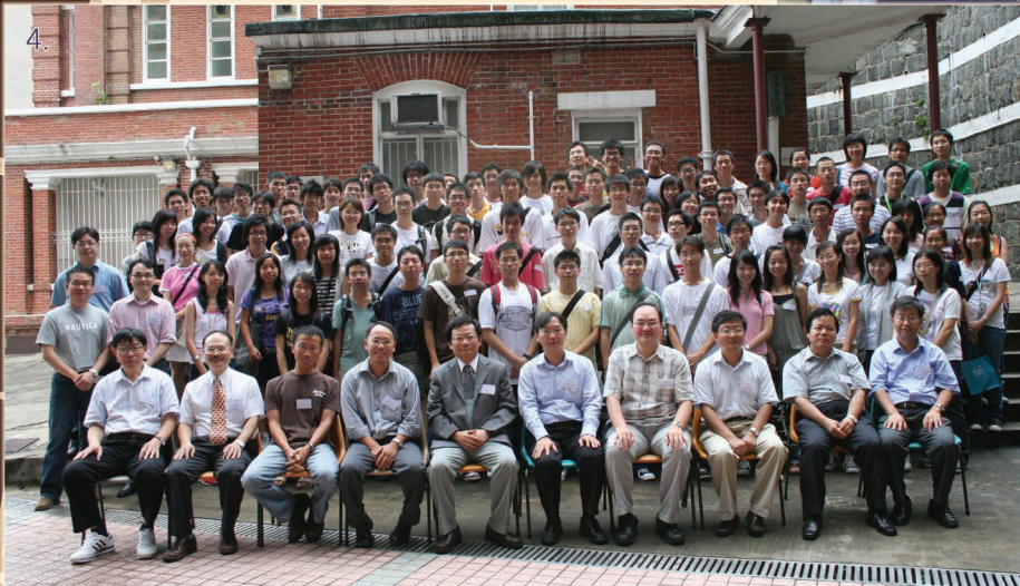
4. Department photo in 2006