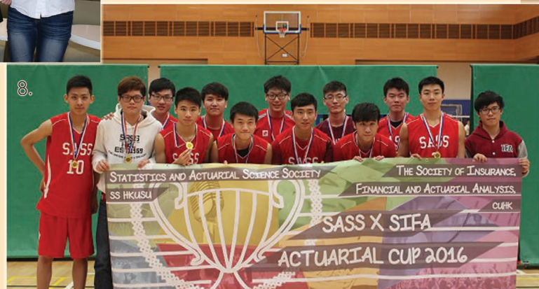
8. SASS x SIFA Actuarial Cup in 2016